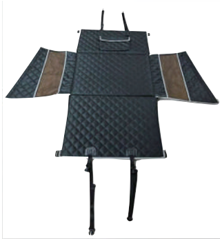
Dog Car Seat 1 pcs